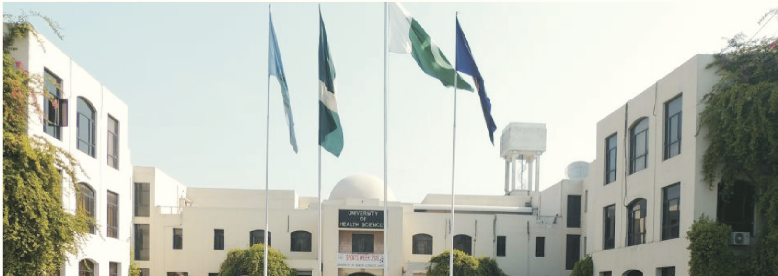
University of Health Sciences, Lahore

3. A candidate who fails in one or more subjects in a professional examination of University of Health Sciences, Lahore, shall, if he / she so desires, provisionally be allowed to join the next higher class till the commencement of supplementary examination. The candidate, however, will have to pass the failed subjects in the supplementary examinations failing which he / she will be detained in that class. Under no circumstances, a candidate will be promoted to next higher class till he / she passes the professional examination of preceding class.